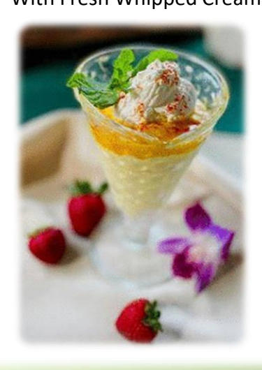
CHOCOLATE GANACHE TORTE $9 With Fresh Whipped Cream Add Ice Cream $4

FROZEN TREAT SAMPLER $14 Please ask us for our Daily Signature Flavors