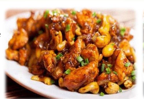
CASHEW NUT WOK FRY Chicken $21 Beef $23 Sautéed Chicken or Beef, Onions, Mushroom & Cashews

ROASTED GARLIC WOK FRY Chicken $21 Beef $22 Sautéed Chicken or Beef with Garlic & Thai Seasoning