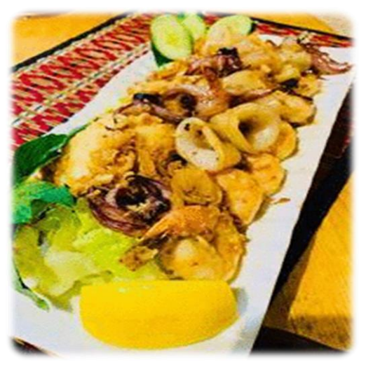
GARLIC SEAFOOD MEDLEY $32 Sautéed Garlic Squid, Shrimp & Fish

Sautéed Shrimp with Young Corn, Onions, Bamboo, Carrots, Red Bell Peppers & Mushrooms in Oyster Sauce