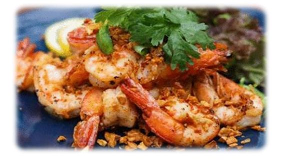
SUGAR SNAP PEAS & SHRIMP $25 Sautéed Shrimp with Snap Peas, Young Corn & Carrots in Oyster Sauce

Sautéed Garlic Shrimp with Thai Seasoning