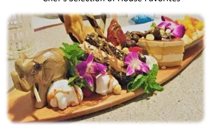
CHEF'S SURFBOARD SAMPLER Chef's Selection of House Favorites

FROZEN TREAT SAMPLER $14 Please ask us for our Daily Signature Flavors