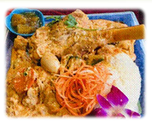
MASSAMAN BRAISED LAMB SHANK $38 Quail Eggs, Bamboo Tips, Chickpeas, Cauliflower Served with Mango Chutney

MASSAMAN CURRY $16 Quail Eggs, Cauliflower, Carrots, Chickpeas, Bamboo Tips Served with Mango Chutney